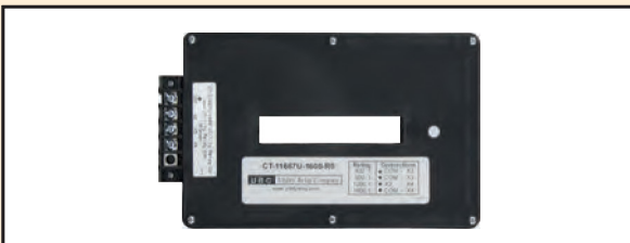
DS Breaker Style 1600/800 AMP PHASE CT