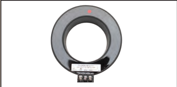
Typical 1600/800 AMP PHASE CT