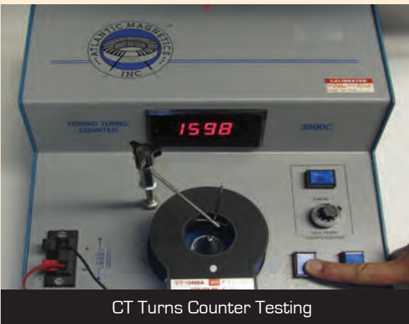
CT Turns Counter Testing