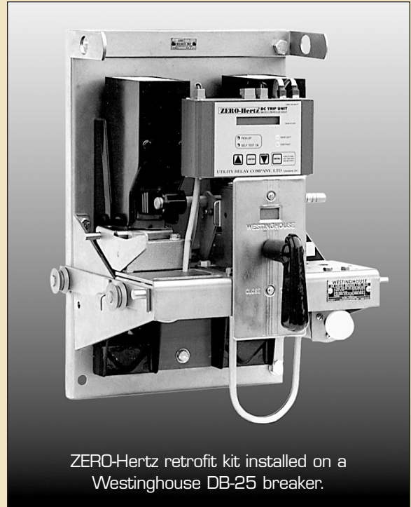
ZERO-Hertz retrofit kit installed on a Westinghouse DB-25 breaker.