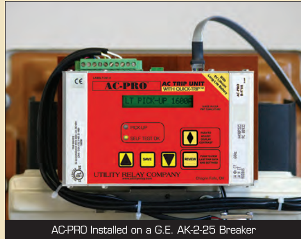
AC-PRO Installed on a G.E. AK-2-25 Breaker

QUICK-TRIP system components stay with the cubicle! Swapping breakers is no problem