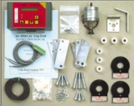
AC-PRO retrofit Kit for G.E. AK-2-25

The AC-PRO can be supplied as part of a complete retrofit kit. Kits include all necessary brackets, mounting hardware, wiring, actuator, and installation documentation and instruction manuals.