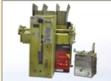
Direct Replacement of a Static-Trip II on a Allis Chalmers LA-600 breaker

Reusing the existing CTs and actuator can greatly reduce material costs and cut installation time to a fraction of that required for a complete retrofit.